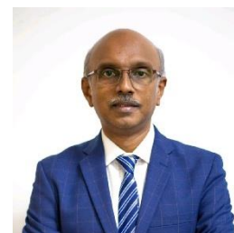
International Arbitrator / ADR Specialist / Legal Scholar

Advocate || Independent International Arbitrator & Mediator ( www.inbavijayan.com ) Managing Partner, Kove Global LLP ( www.koveglobal.com ) Registered Foreign Lawyer, SICC Singapore (2023-24), UK (2023-24) and AIFC Kazakhstan SCC/SAA Diploma in International Arbitration for Foreign Arbitrators, Sweden (June 2022) Regional Pathway Leader (RPL), Course Director & Fully Approved Tutor, CIArb UK Co-Chairperson, Chartered Institute of Arbitrators South India Chapter EC Member of SICCI & Chairman, SICCI Arbitration Committee, India Advisor & Course Director, Bangladesh International Mediation Society, Bangladesh Visiting Professor, TNDALU, Indian Maritime University and Manipal Law School Global Advisory Board Member, Hyderabad Arbitration Centre, India Professional Development & Education Committee Member, AIADR, Malaysia Managing Committee & Global Advisor, Kovise Foundation Conflict Resolution International (KFCRI) Governing Council Member, Indian Council of Arbitration (ICA) Institutional Ethics Committee, Women's Christian College, Chennai (2022 and 2023) Lead, Business Delegation to Czech Republic, Israel, France, Indonesia, Mauritius, Reunion Island and USA Technical Assistance & Advisor – Various ADR Institutions – Worldwide Founder, Global South ADR Alliance (GSADR Alliance)